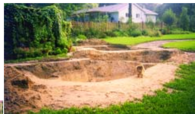
The first pond...