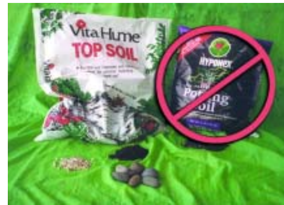
Planting ingredients are simple: top soil, gravel, and rocks. Heavy loam (with some clay) from your yard is the ideal planting media. Never, ever, use potting soil mixes.

Soil is the critical component that anchors your plants, while allowing the roots to spread out and obtain nutrients. Just like with containers, there are several alternatives. The simplest is actually no soil at all. One link in a fishpond's