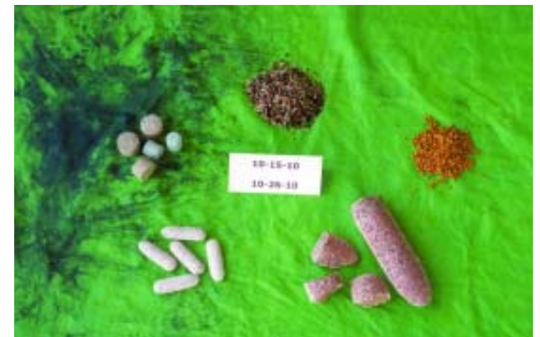
Many kinds of fertilizers can be used for water lilies. Clockwise from the top: ordinary garden fertilizer; timed-release fertilizer; tree spikes, broken into smaller chunks; tomato or potted plant spikes; aquatic plant tablets. The best fertilizers also include micronutrients. Always select formulas like 10-15-10 or 10-26-10.

Reprinted with permission from KOI USA magazine, May/June 1999. Call 888-660-2073 for subscription information. Paula Biles is the vice-president of the Florida West Coast Koi and Water Garden Club.