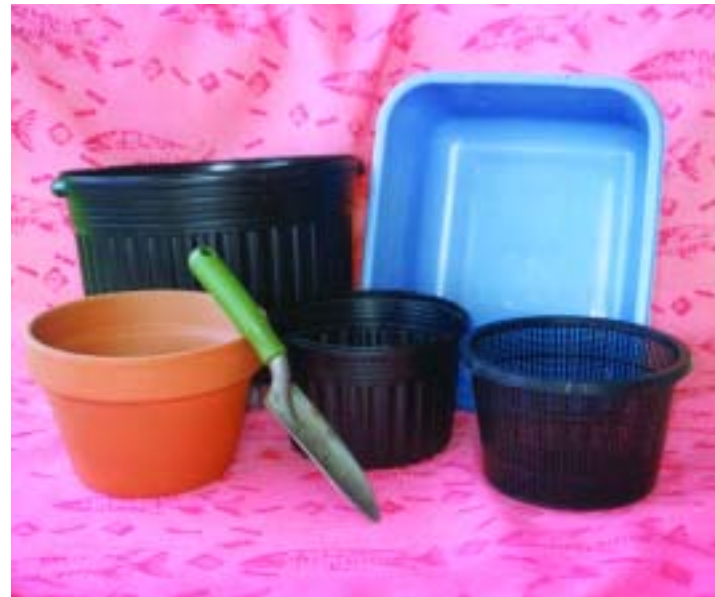
The pot option is infinite, however, select the largest that fits into your pond. Shown here: black hole-less water lily pots (1 & 3 gal); 1-gal mesh basket (more useful for marginal plants); a clay azalea pot; and a dishpan. Any shallow wide container will work.

Some people think pots with holes provide a better exchange of gases and get more air to the roots. Others, like me, think holes are a pain in the neck and allow more fertilizer to seep into