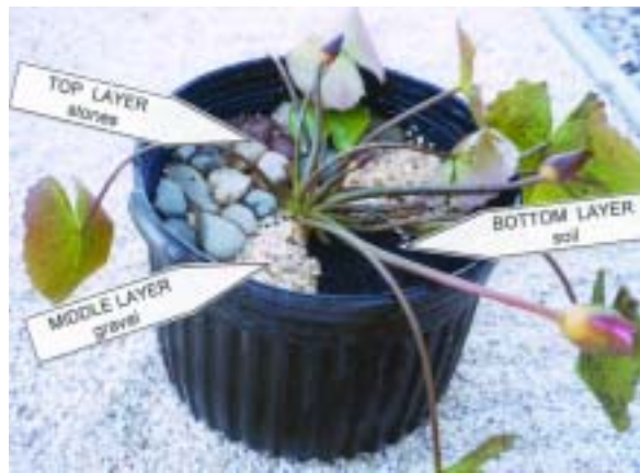
The critical step when planting a water lily is to leave the growing tip exposed. As shown with this tropical lily, the tip must stick out from the soil. It must also be above the top layer of gravel or stone.

That's all there is to it. A well-planted water lily will be healthy and produce lots of blooms throughout a long season. With regular fertilizing, it will not need to be repotted for at least a year or two, depending upon where you live.