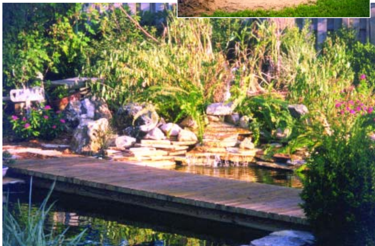
and the second pond.