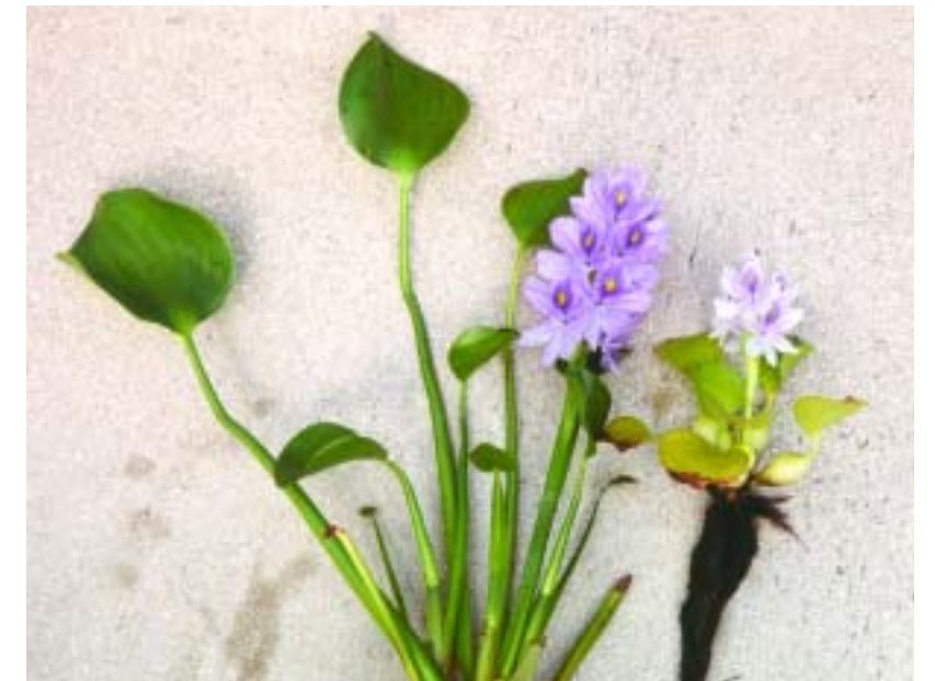
Signs of insufficient fertilizer are usually easy to identify. Compare the healthy plant on the left with the smaller nutrient-starved one to the right. The lack of food causes stunted growth, plus paler leaf and blossom colors.

Okay, you've gotten all this stuff. Now what should you do with it? Well, potting or repot-