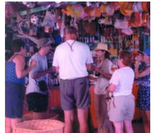
An important part of native life along the Amazon are the floating stores that anchor at various points in the River, awaiting the boat arrival of shoppers.