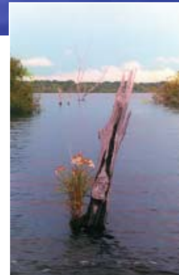
The explorers passed a Galeandra species orchid growing in the River.

the incredible shooting star that blazed across the sky in a slow, bright arch before fragmenting over the rainforest, to the big things like meeting the people of Brazil and