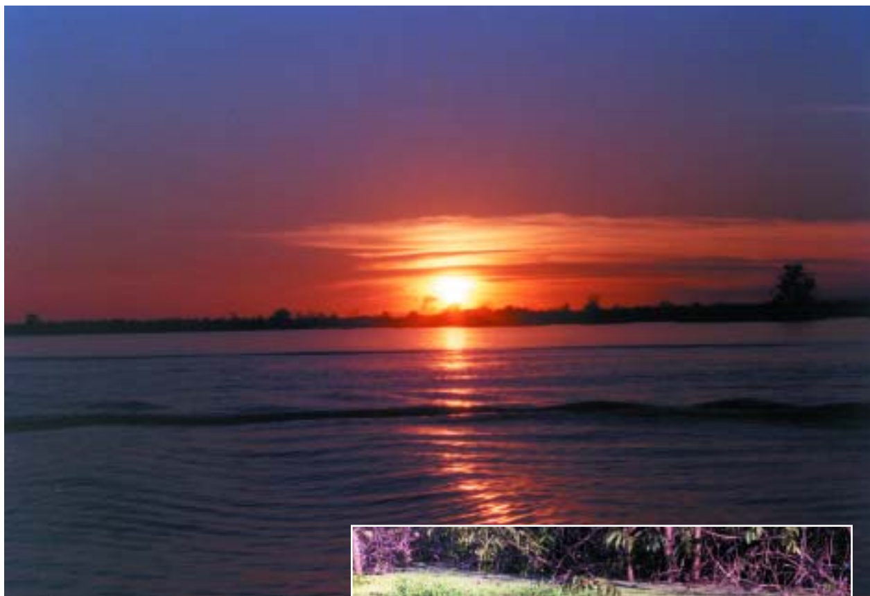
Often the Amazon River is so wide that but a fringe of trees can be seen on the far bank.