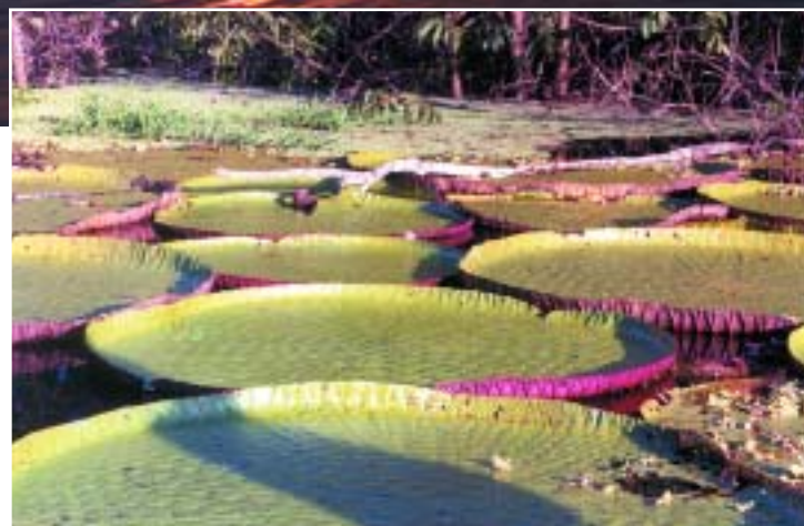
One of the most exciting moments of the trip was finding a Victoria leaf measuring 81 inches.

Throughout our excursions, we discovered wildlife such as the reptilian caiman, the yellow rumped cacique birds that build long, swallow-like nests in colonies along the river, hummingbird-sized tarantulas, brilliantly colored parrots, and leaf cutter ants, most of these seen only before on the Discovery Channel.