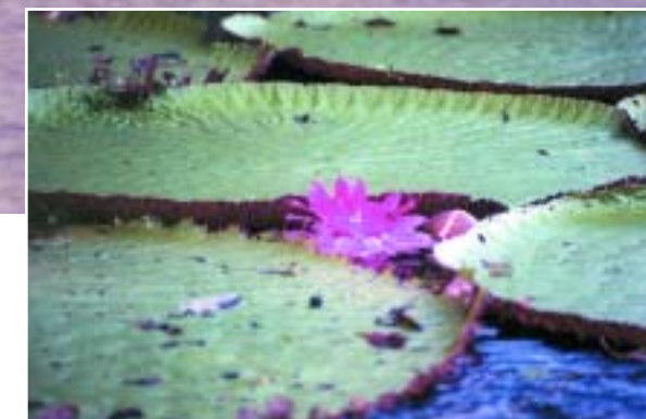
(above) Along the Amazon, homes are built on stilts so that they can float when the River rises. (inset) Opening the second night, the flower of Victoria amazonica is rosy pink to red.