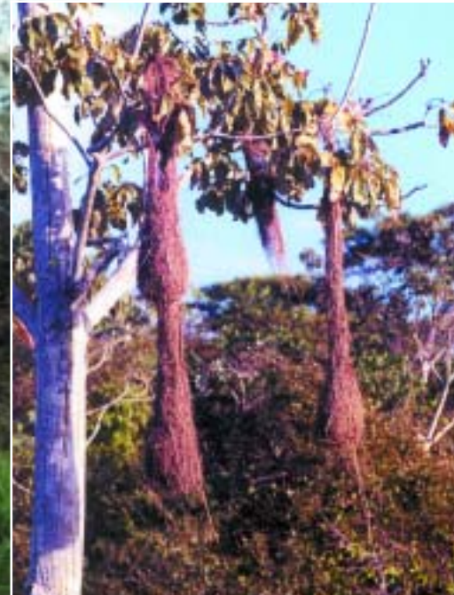
The nests of a colony of yellow-rumped cacique look like woven stockings hung among the tree's branches.

There were times when you barely could see the bank on the other side of the river. From small things like riding on the river while the rain fell, to