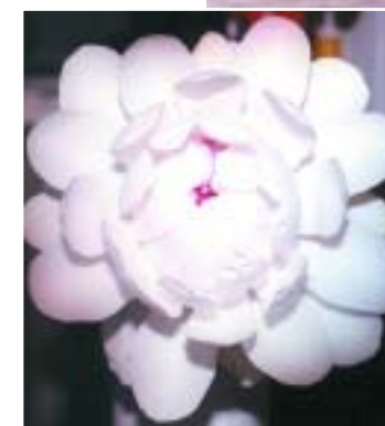
The first-night flower of Victoria amazonica is a fragrant and pristine white.

This was nearly 20 inches larger than any person in our group had ever personally seen. Before leaving the white-water Amazon home of the great Victorias, about half of our group arose at four in the morning for one last look at the magnificent leaves and still-open