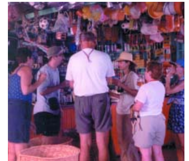
An important part of native life along the Amazon are the floating stores that anchor at various points in the River, awaiting the boat arrival of shoppers.