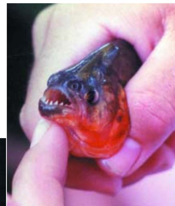
Piranha are notorious for their sharp teeth and carnivorous feeding, although they are 'the eaten' more often than not.