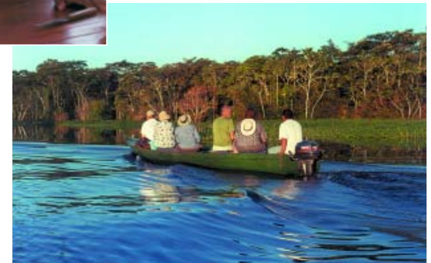
Two or three times a day, the group boarded the three motor boats for mini-expeditions.

We began our adventure on June 6, 2000, in the Manaus region. Because it was the start of the 'dry'