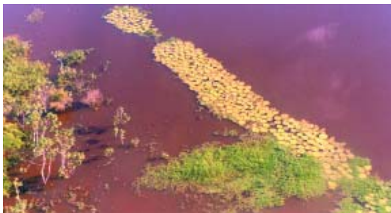
Flying into Manaus, the legendary Victorias are visible 300 feet below.