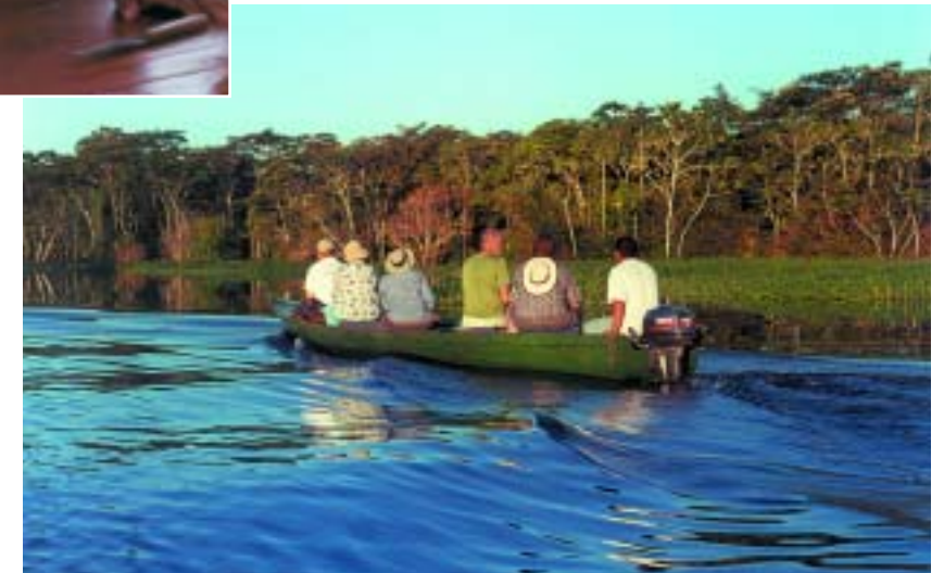
Two or three times a day, the group boarded the three motor boats for mini-expeditions.

We began our adventure on June 6, 2000, in the Manaus region. Because it was the start of the 'dry'