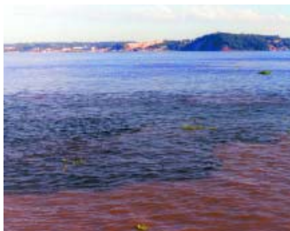
For several miles the low-pH Rio Negro flows side by side with the 'white' waters of the Amazon River, creating what is known as 'the wedding of waters.'

We made three to four motor boat explorations each day. On one trip, we spotted red howler monkeys high in the trees along