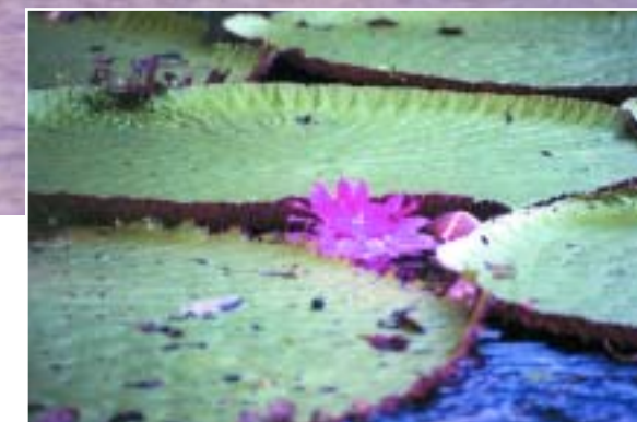
(above) Along the Amazon, homes are built on stilts so that they can float when the River rises. (inset) Opening the second night, the flower of Victoria amazonica is rosy pink to red.